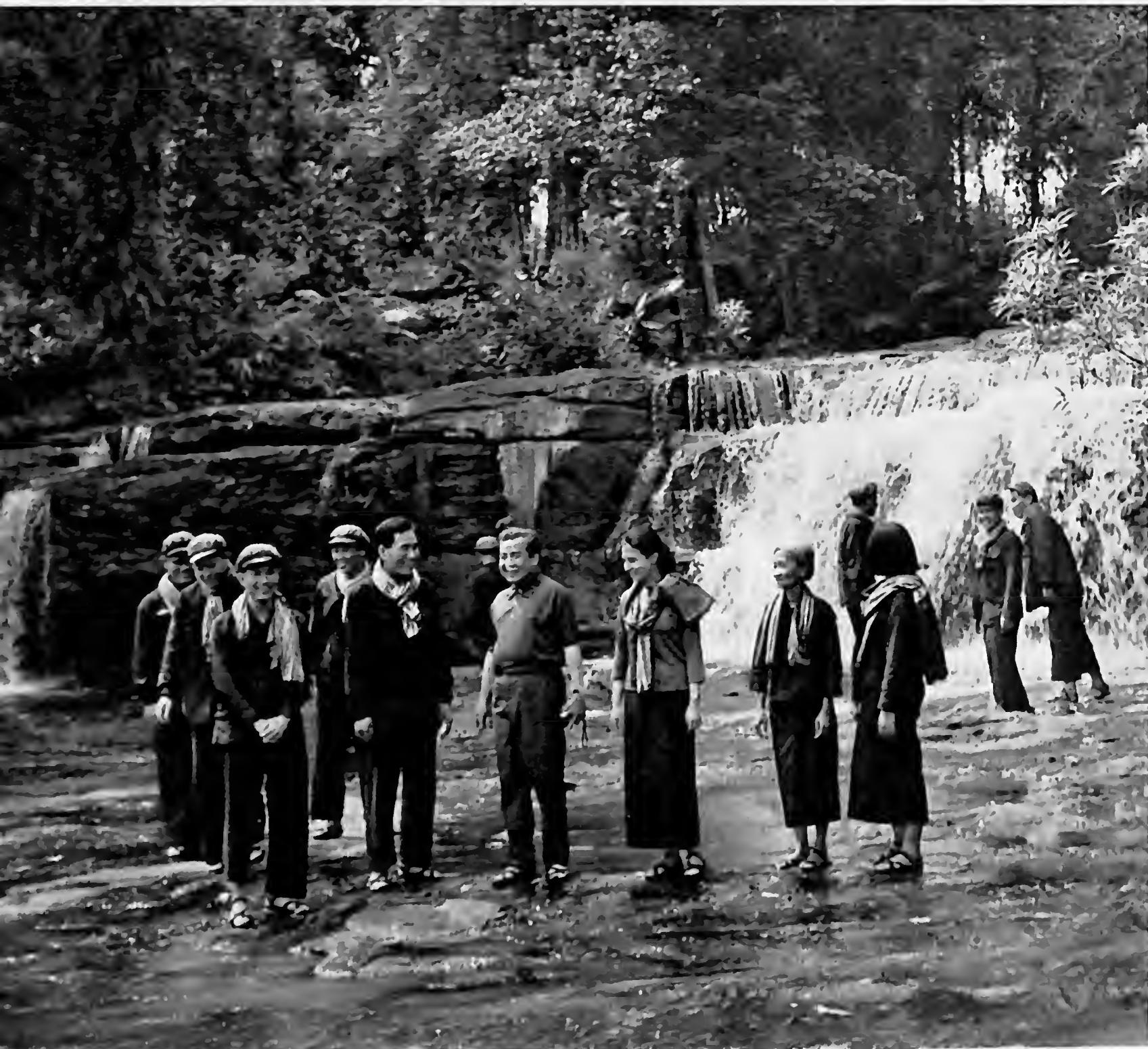
On Lichee Mountain.